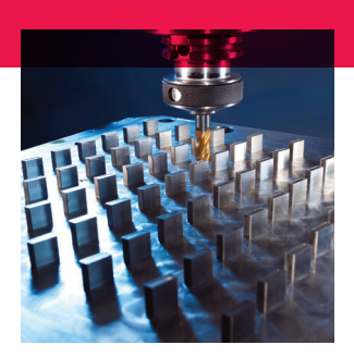
Custom tooling and o-ring molds for fast prototyping