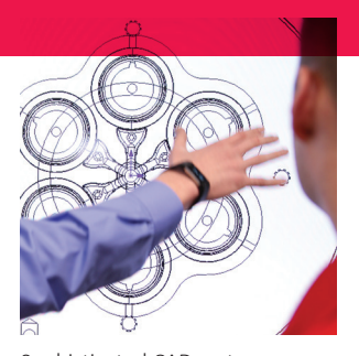
Sophisticated CAD systems for design engineering