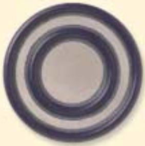
This Filter Seal® features a metal screen in a composite seal design for both I.D. and O.D. filtration in an oil application. A variety of elastomer materials are available for this type of seal.