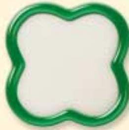
A Filter Seal® produced in medical grade silicone for blood-contact filtration. Seal requires high precision tolerances.