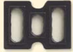
Filter Seal® used in applications including valves and ports where it is critical to keep contamination and particulates out of small orifices.